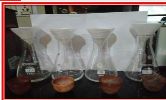
Determination of acid insoluble ash